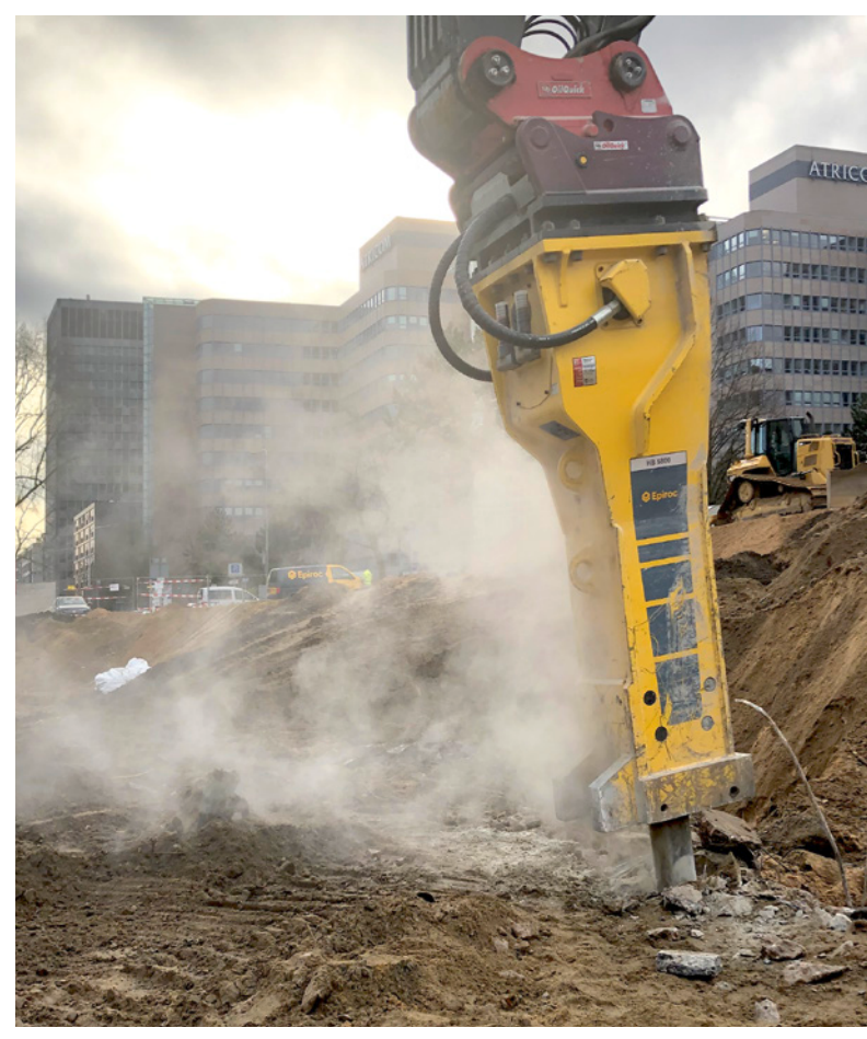
The robust design and high durability make the Heavy Breakers suitable for the toughest jobs.